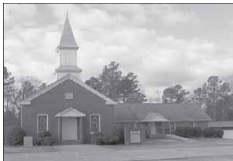
New Hope Baptist Church

The site of the original sanctuary was located 4 miles north of our present site where Spring Creek Baptist Church is presently located. The original church was made of logs and stood on rock pillars, which can still be seen in the woods today.