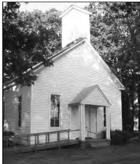
York Chapel United Methodist Church