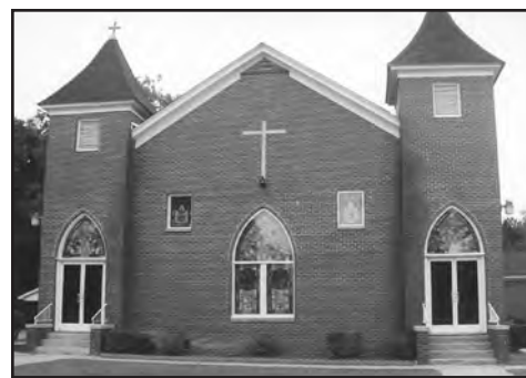
Mt. Pleasant Missionary Baptist Church

For 142 years, Mt. Pleasant Missionary Baptist Church has faithfully served the Drewry-Manson Community. Now, with a growing congregation