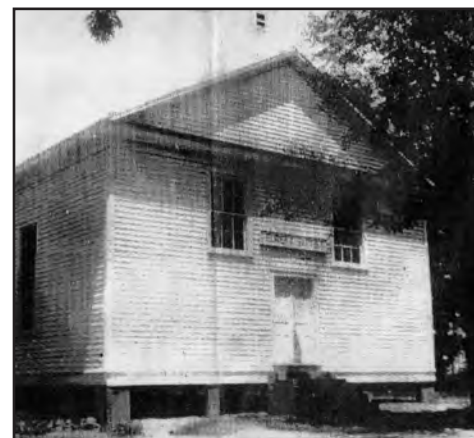
Eureka Baptist Church - 1919