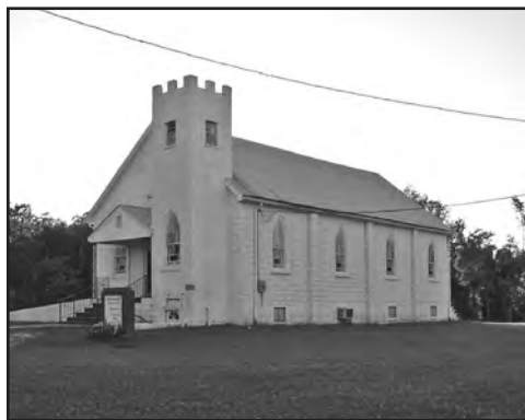
Mt. Calvary Baptist Church

In September 1908 land was deeded to the group, and a sanctuary was constructed.