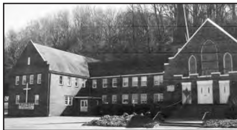
Bassett Memorial U.M. Church